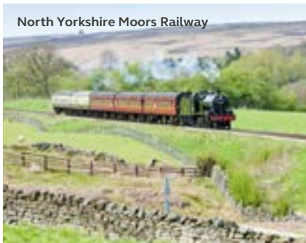
North Yorkshire Moors Railway