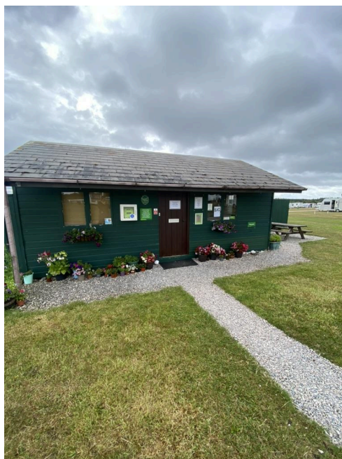
Entrance to Reception