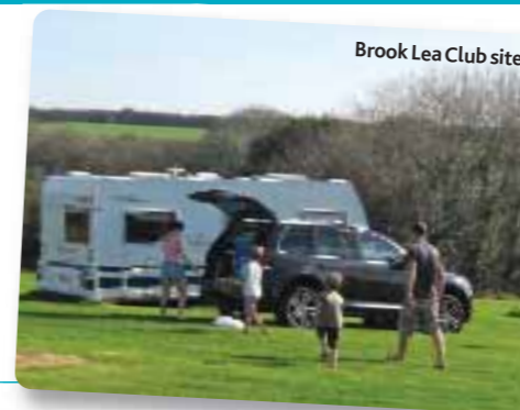
Brook Lea Club site