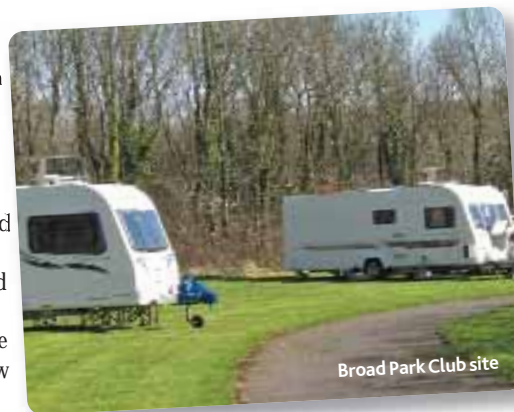
Broad Park Club site

Broad Park Club site, half an hour south-west of Dartington, is a great family base where the pitching areas are separated by mature shrubs and trees, a field for play, a boules pitch and play equipment.