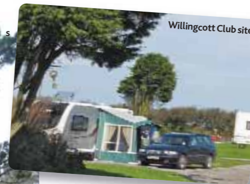
Willingcott Club site

display maritime decorations on their doors. In a side street, I joined a small queue for the best fish and chips I've ever had; cooked fresh to order in Sylvesters. These were eaten on the waterside, followed by a Hocking's ice cream – incredibly tasty and made in the village.