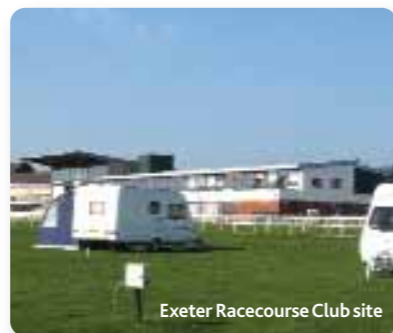
Exeter Racecourse Club site

Food always features large for me on a good holiday. Wandering south, I headed for the little waterside village of Instow, where I discovered a tiny ferry across to Appledore. This operates when the tide is