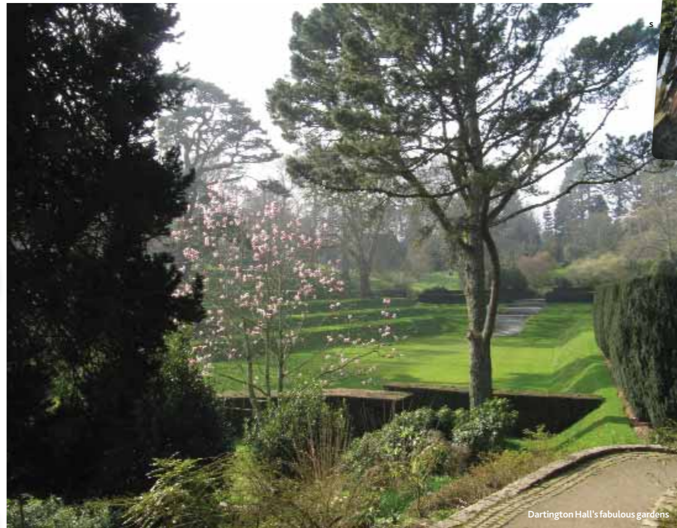
Dartington Hall's fabulous gardens

and enjoy local music in the evenings. The valley was once the haunt of smugglers and there are many tales of nefarious deeds. The walk along the high coast path into Ilfracombe was glorious, if a little breathtaking, and coming down into the town took me over the famous Tunnels Beaches. Reached through rock tunnels carved in 1820, these were renowned for their tidal bathing pools and once had wonderfully-exact rules for segregated swimming. The pools are still a perfect place for safe swimming and rockpooling is also a favourite pastime on the beach. You can even get married here.