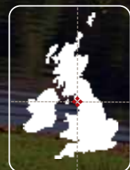
Ordnance Survey Landranger Map 96