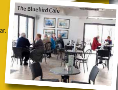
The Bluebird Café