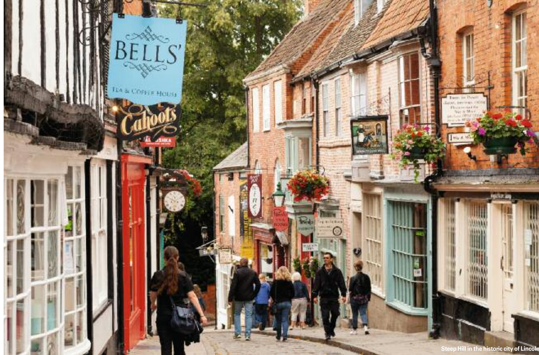
Steep Hill in the historic city of Lincoln

Contact: 01909 542704, harleygallery.co.uk/visit/lime-house-cafe Nearest featured site: Clumber Park