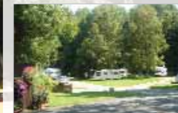
4. BROMYARD DOWNS See p123 of the Directory