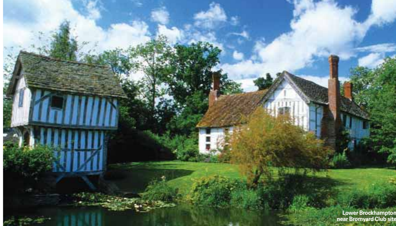
Lower Brockhampton near Bromyard Club site

"Bromyard has an old-fashioned feel thanks to its collection of small local shops"