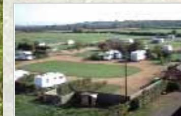
1. HARBURY FIELDS FARM AS See p128 of the Sites Directory & Handbook 2013/14