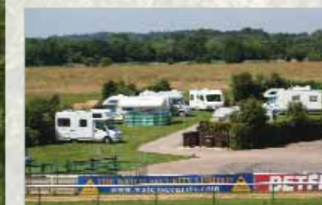
2. WARWICK RACECOURSE See p140 of the Directory