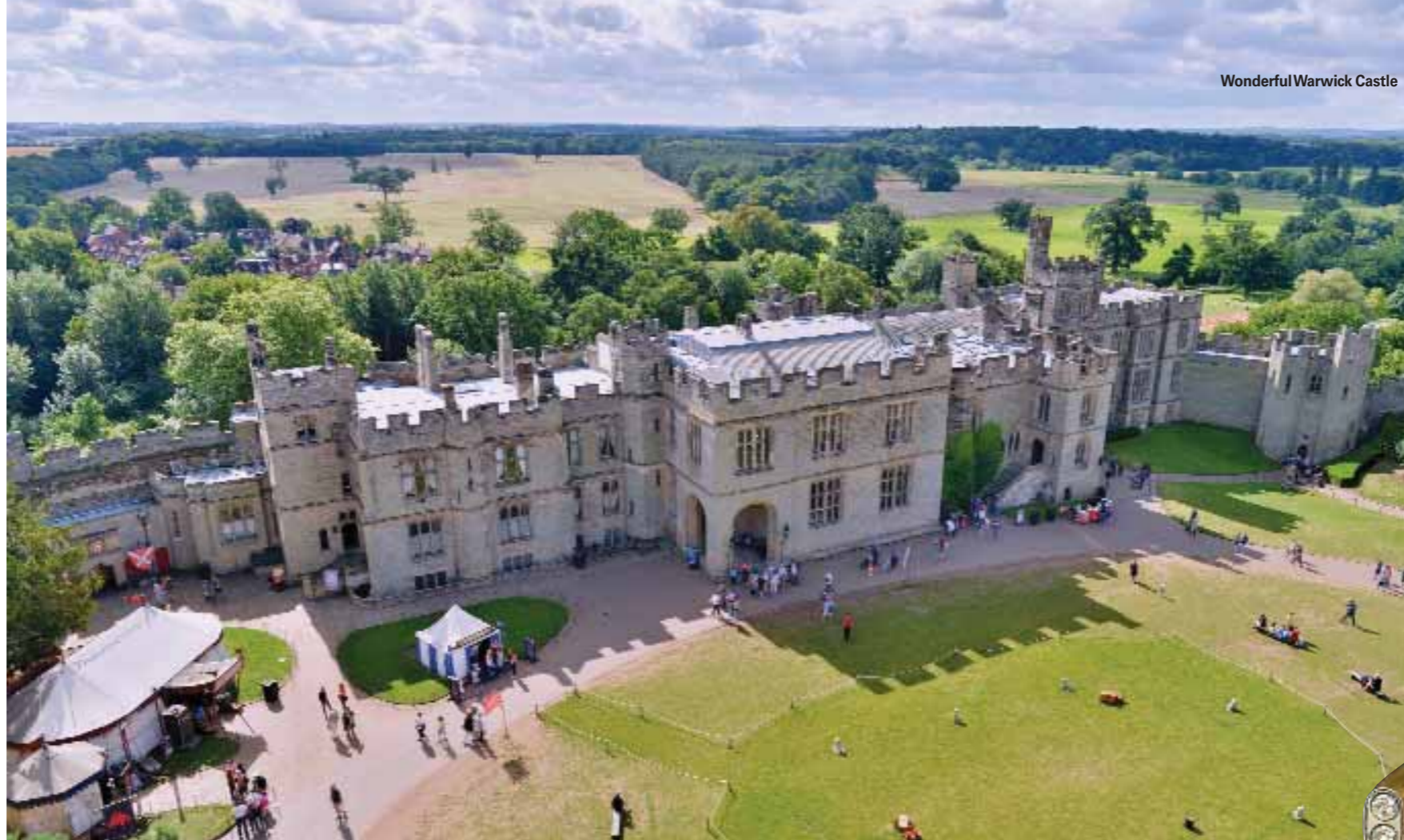
Wonderful Warwick Castle

Contact: 01926 612976, thewhitehartufton.com Nearest featured site: Harbury Fields Farm AS