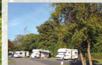
3. CHAPEL LANE See p125 of the Directory