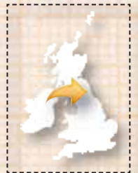
Ordnance Survey Landranger Map 87

3 At a path crossroads, leave the main track to turn left, continuing to walk around the lake. The now grassy track takes you along the banks of the lake, which should (for the first half of this walk) always be on your left. Follow this path until you pass through the