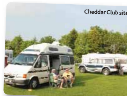
Cheddar Club site

The Club site at Wincanton Racecourse, 20 miles from Longleat, off the A303, is ideal for overnighters heading to or >>