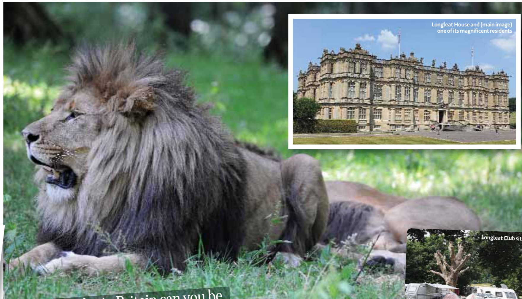
Longleat House and (main image) one of its magnificent residents

T 01749 813213 W themontagueinn.co.uk Nearest featured site Wincanton Racecourse