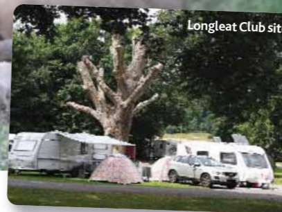
Longleat Club site

While three of our site quartet are actually in Somerset, Longleat is across the county border (just) on the West Wiltshire Downs. The largest of our selection, with 165 pitches, it is in the grounds of the Longleat Estate, close to the famous safari