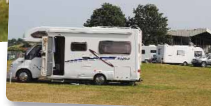
Wincanton Racecourse Club site

from Devon and Cornwall. Normally, pitching is right beside the track, but on race days all caravans must be moved from the barrier so punters can see where their bets are going. Even if you're not a gambling fan, it's great to capture the excitement of a race meeting, free for caravanners on site. Five fixtures in the spring, out of an annual calendar of 17 jump meetings, coincide with the site's opening dates.