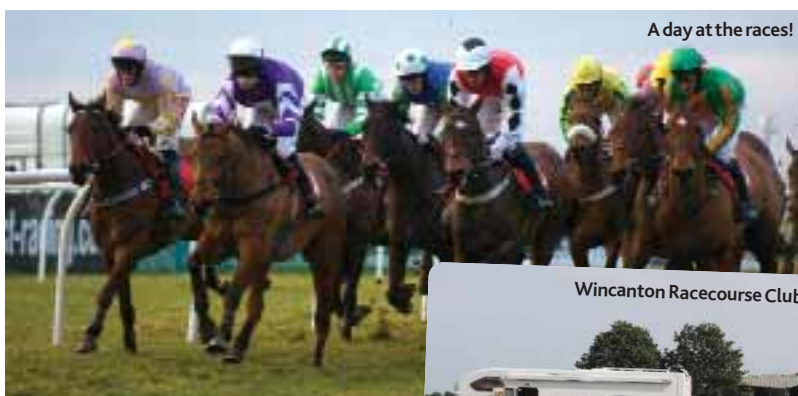
A day at the races!