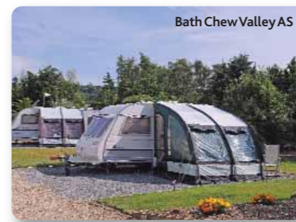
Bath Chew Valley AS

WINCANTON RACECOURSE See p117 of the Directory