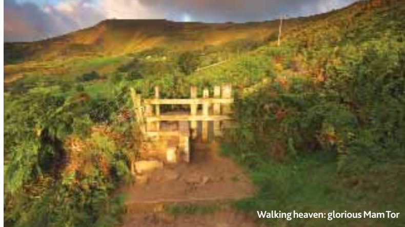
Walking heaven: glorious Mam Tor