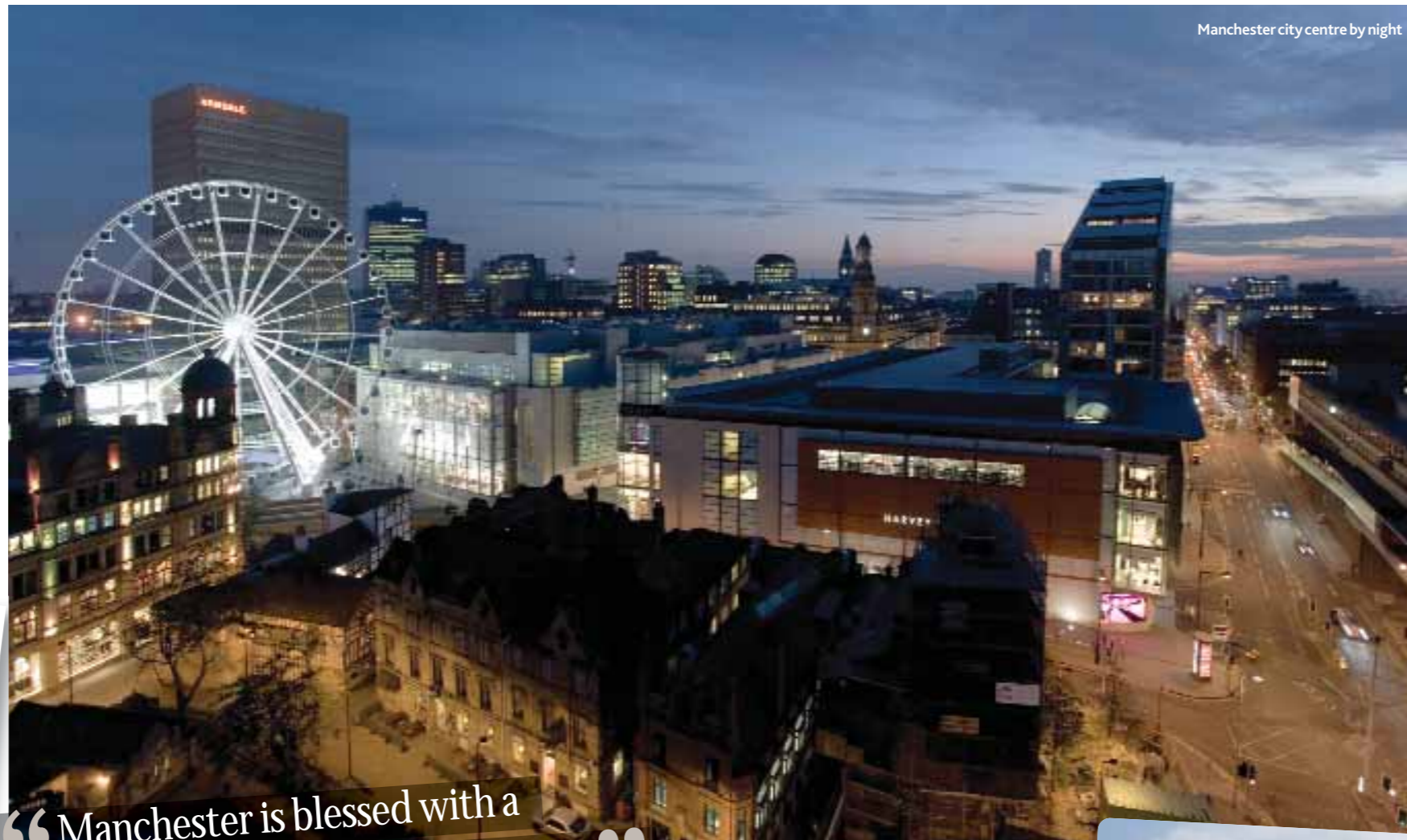
Manchester city centre by night

T 01298 78752 W columbinerestaurant.co.uk Nearest featured site Buxton