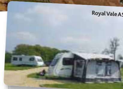
Royal Vale AS

From here, it's a short drive – or tram ride – into Manchester's vibrant city centre, and thence onwards to the south of the city and the leafy prosperity of Cheshire. This is footballers' wives country, where 4x4s and Ferraris are more numerous than in the wealthy commuter belt of Surrey in the South East.