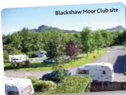
Blackshaw Moor Club site

The city's nightlife is legendary and while dancing at a sweaty all-nighter may