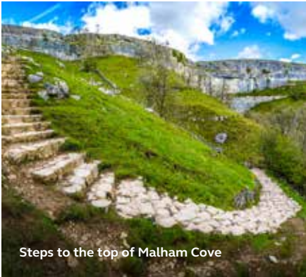
Steps to the top of Malham Cove