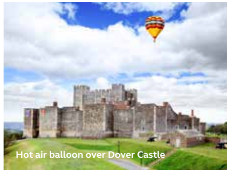
Hot air balloon over Dover Castle