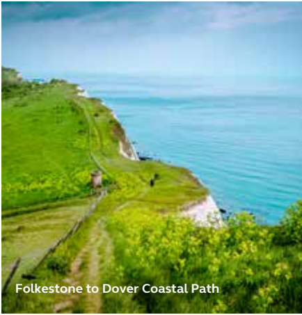
Folkestone to Dover Coastal Path